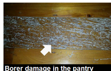
Borer damage in the pantry

Yes - Anobium borer damage was noted to the following timber(s)/area(s). Without destruction of the timbers it is not possible to determine whether activity exists or the extent of timber damage within.