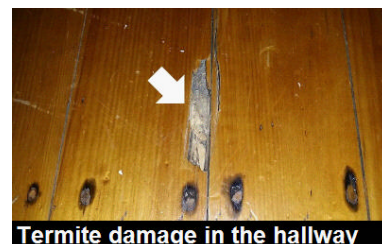
Termite damage in the hallway

Yes - Inspection revealed currently inactive termite attack (damaged timbers and/or termite workings) within this area including but not necessarily limited to the following timbers and the areas listed below. Also refer to section 5.0 (Evidence of Termite Damage) at the end of this report.